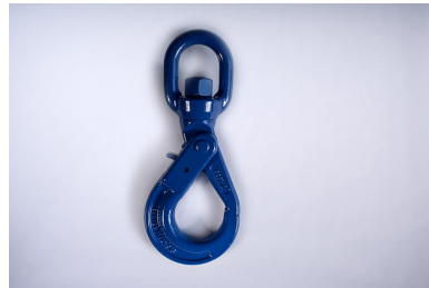
G-100 Swivel Self Locking Hook