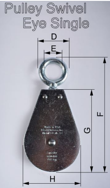
pulley swivel eye single