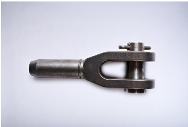
Socket Swage Open front