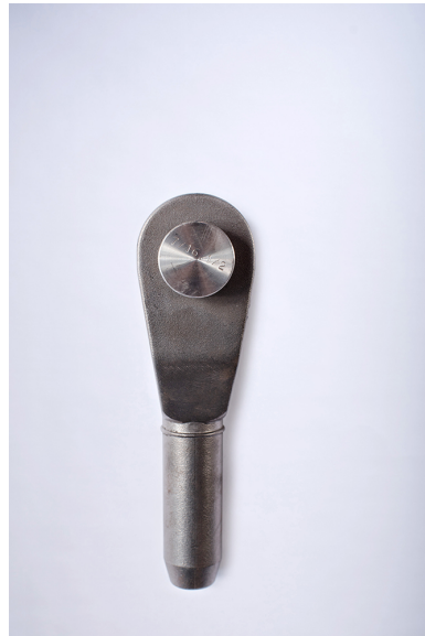
Socket Swage Open side