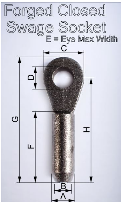
Forged Closed swage socket