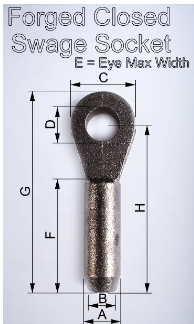
Forged Closed swage socket