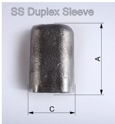
SS Duplex Sleeve