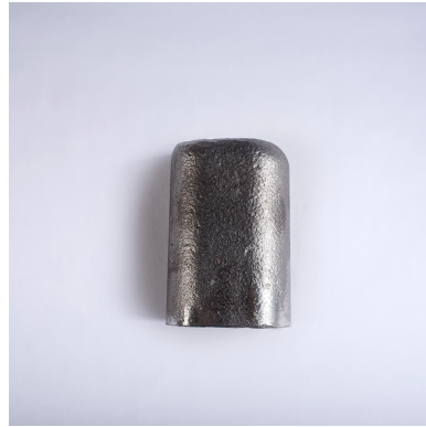
Stainless Steel Duplex Sleeve B (side)