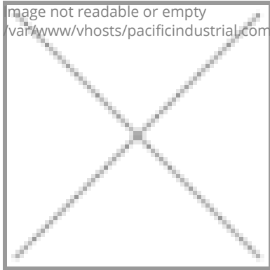
red drainage hose

image not readable or empty /var/www/vhosts/pacificindustrial.com/httpdocs/ecom_img/original-401-reddrainage.jpg