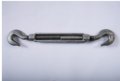
Galvanized Hook and Hook Turnbuckle