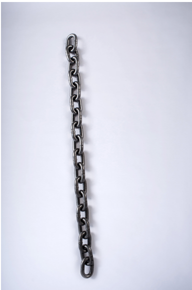
G-40 High Test