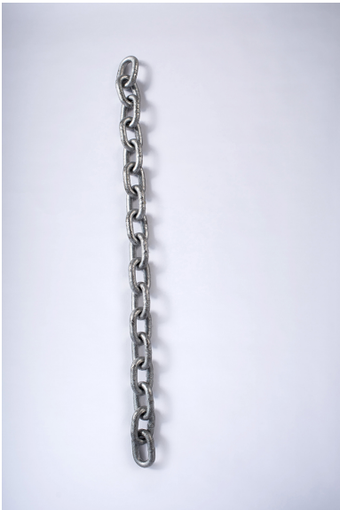
G-30 Galvanized Proof Coil