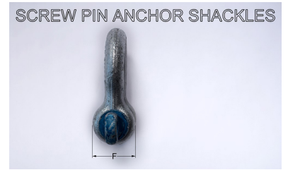
Screw Pin Anchor Shackle DimMap side