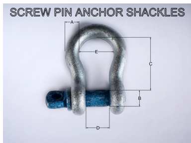
Screw Pin Anchor Shackle DimMap