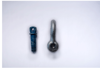
Screw Pin Anchor Shackle D (Dimension)