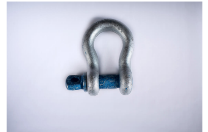
Screw Pin Anchor Shackle A