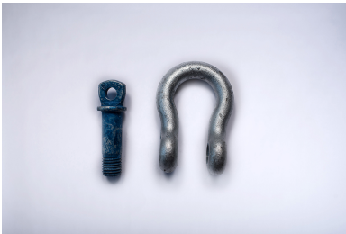
Screw Pin Anchor Shackle C (dimension)