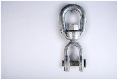
Galvanized Jaw and Eye Swivel