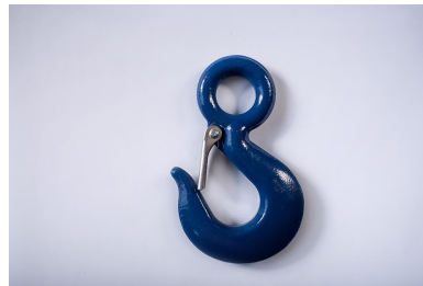
Alloy Eye Sling Hook Latch