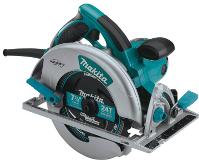
Makita 5007MG Product Shot

Magnesium components create a lightweight saw (10.6 lbs.) that is well balanced and jobsite tough. Make quick, one-handed adjustments using large, rubberized levers. Large cutting capacity (2-1/2" at 90°) and bevel capacity (0°-56°) with positive stops at 22.5° and 45°. Two built-in L.E.D. lights illuminate the line of cut for increased accuracy. Powerful 15.0 AMP motor delivers 5,800 RPM for proven performance and jobsite durability. Better fit and more control with comfortable rubber grip on handle. Settings are easy to read with oversized number and ruler markings. Built-in dust blower clears the line of cut for greater accuracy. Blade wrench is attached to saw for fast and convenient blade changing. Reinforced power cord withstands jobsite abuse and lowers repair costs. Includes a premium 7-1/4" carbide tipped framing blade that cuts 50% faster and lasts 2x longer.