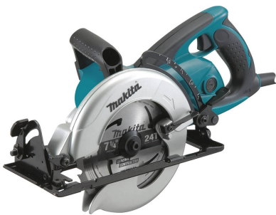
Makita 5477NB Product Shot

Hypoid gears deliver more power and have greater surface contact than conventional worm drive gears. Powerful 15 AMP motor for increased productivity. Oil bath technology and sealed gear housing for less maintenance. 0°-51.5° bevel capacity with positive stops at 45° and 51.5° is ideal for truss and rafter cut-outs. High quality, heat treated hypoid gears are engineered for long lasting performance. Large cutting capacity (2-3/8" at 90°; 1-3/4" at 45° and 1-9/16" at 50°). Lower guard design improves performance when making bevel and narrow cuts. Oversized top handle for better fit and added comfort. Large levers for fast bevel and depth adjustments. Push button spindle lock for easy blade changes. Blade wrench is attached to the saw for fast and convenient blade changing. Ergonomically designed rubberized grip for improved control. Base plate is chemically treated to resist rust and warping for superior cuts. Reinforced 10 ft. cord withstands jobsite abuse. Large and easy to read markings on depth and bevel scales. Externally accessible brushes for easy replacement and extended tool life. 24T thin kerf carbide tipped blade for fast cutting. Ideal for framers, builders, masons and contractors.