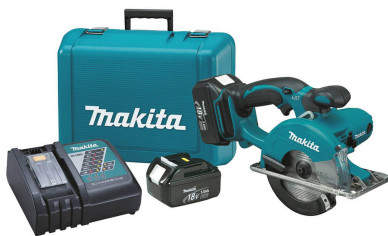
Makita XSC01 Kit Shot

Makita-built motor delivers 3,600 RPM for faster cutting. Cuts a wide range of metals including Unistrut®, all thread, channel, conduit, pipe, sheet metal, square tubing, steel and more. Compact and ergonomic design at 13-3/4" long. Weighs only 5.7 lbs. with battery for reduced operator fatigue. Rubberized soft grip handle provides increased comfort on the job. Built-in L.E.D. light illuminates the work area. Heavy gauge, precision machined base for smooth, accurate cutting and added durability. Equipped with Star Protection Computer Controls to protect against overloading, over-discharging and over-heating. Rapid Optimum Charger communicates with the battery's built-in chip throughout the charging process to optimize battery life by actively controlling current, voltage and temperature. Rapid Optimum Charger has a built-in fan to cool the battery for faster, more efficient charging. Makita technology delivers category-leading charge time, so the battery spends more time working and less time sitting on the charger. Compatible with Makita 18V Lithium-Ion batteries with a Star symbol. 3-year limited warranty on tool, battery and charger. \Only use genuine Makita batteries and chargers.