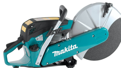
Makita EK6101 Feature Shot (tool with blade)