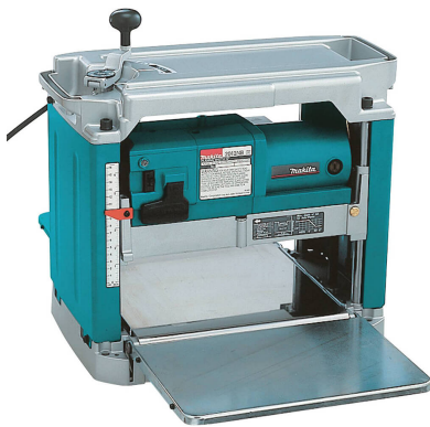
Makita 2012NB Product Shot

Compact with less weight for easy transporting to the jobsite. Engineered for faster, easier blade changes. Low noise (83dB) for operator comfort. 4-post design and diagonal cross supports for stability. Large table extensions to support the workpiece. Fully adjustable depth stop for repeat cuts. Powerful 15.0 AMP motor for improved performance. L.E.D. light indicates that the planer is plugged into the power source. Large and easy-to-operate on/off paddle switch. Double edge planer blades. Easily adjustable cutting depth for precision planing. Detachable tool box for storage of the standard equipment. Optional dust hood enables dust collection system to be connected to planer.