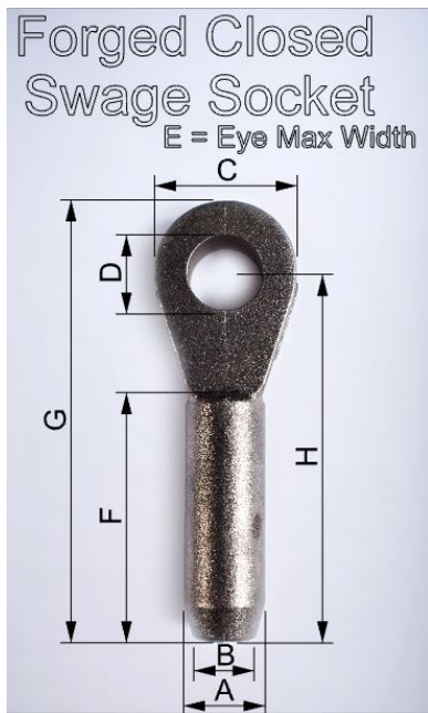
Forged Closed swage socket