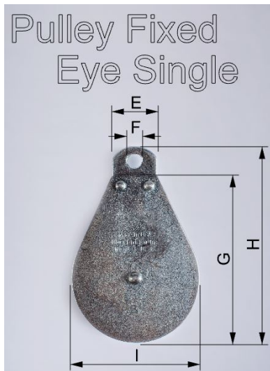
pulley fixed eye single